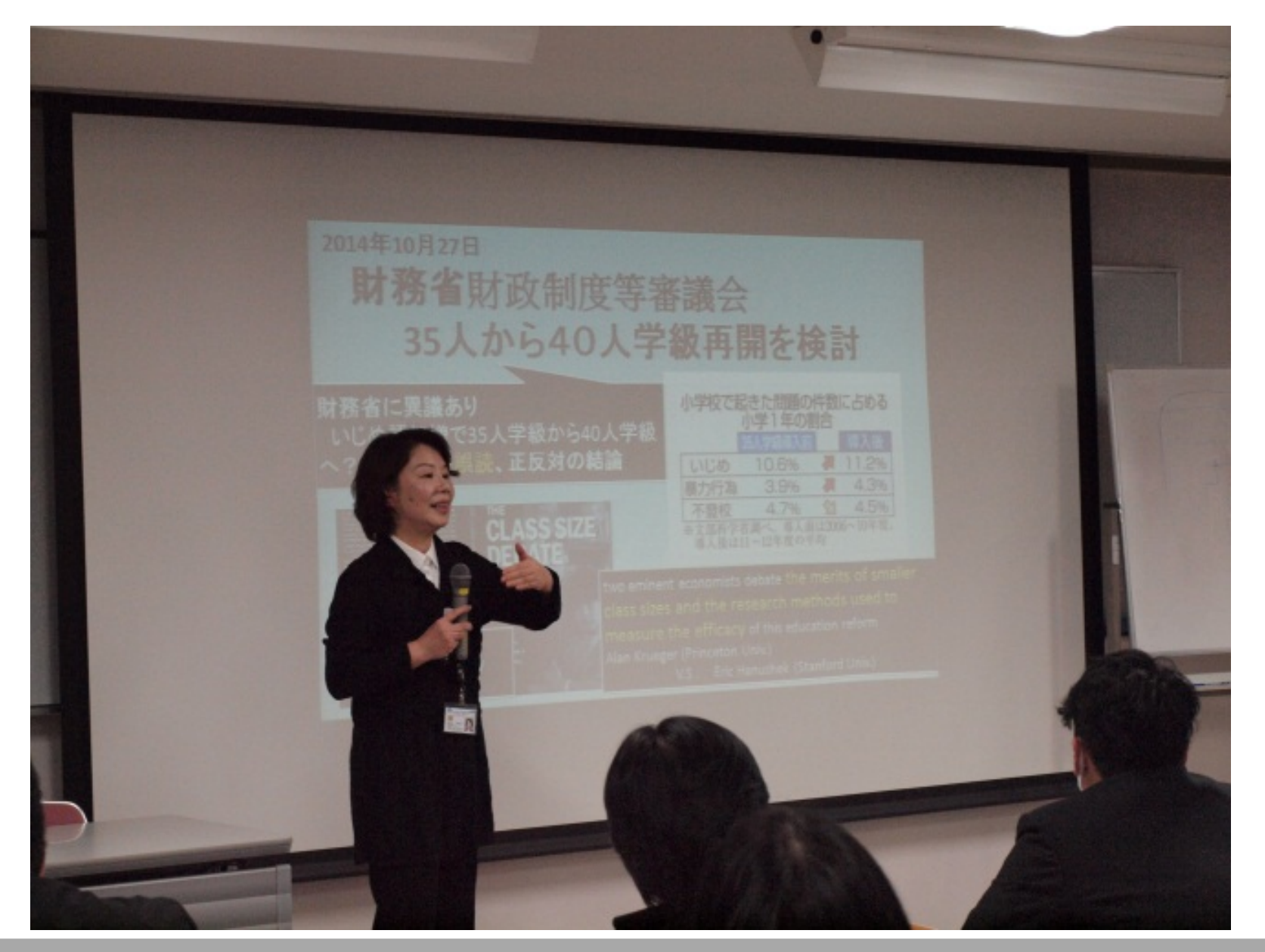
Training sessions for statistical teachers