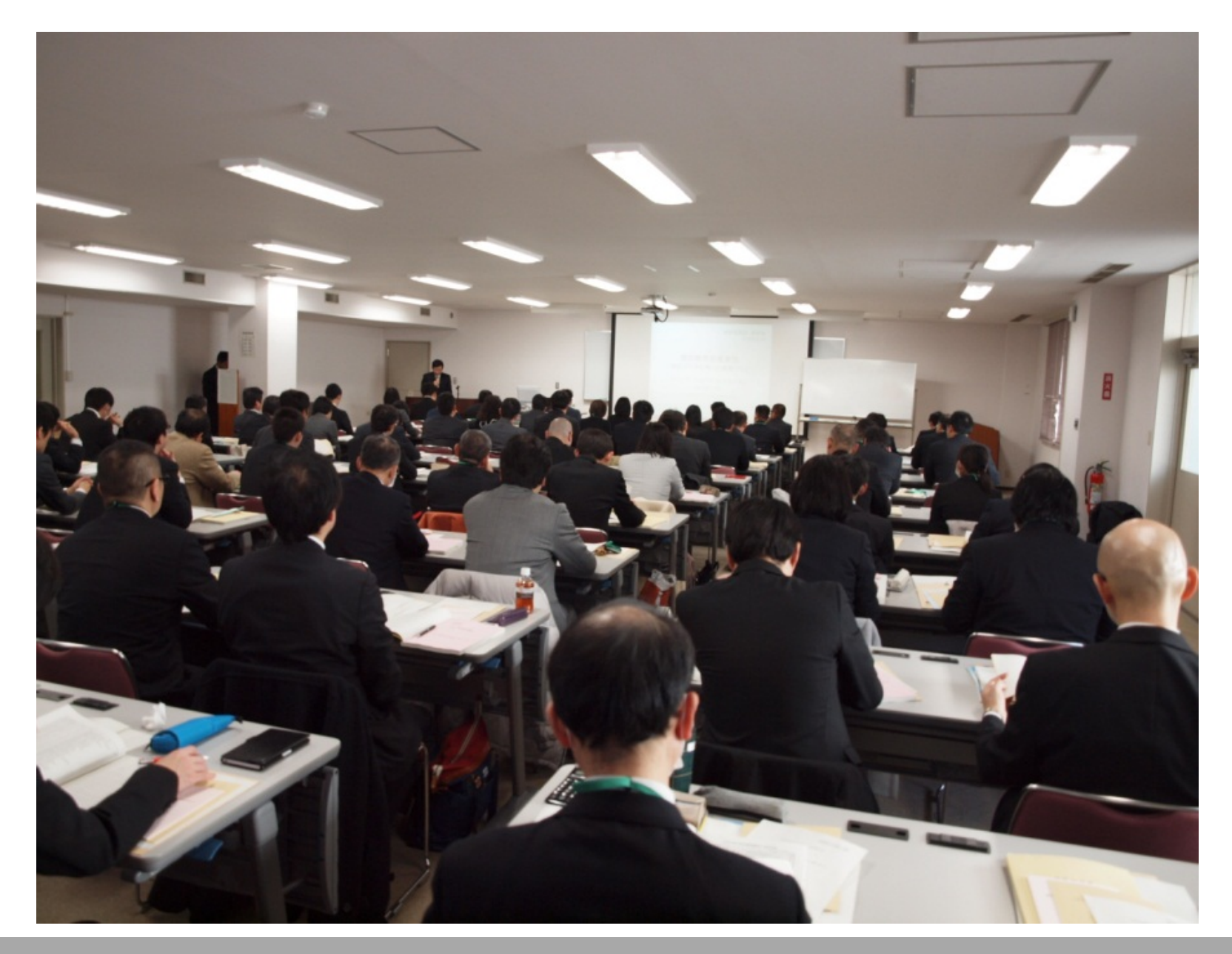
Training sessions for statistical teachers