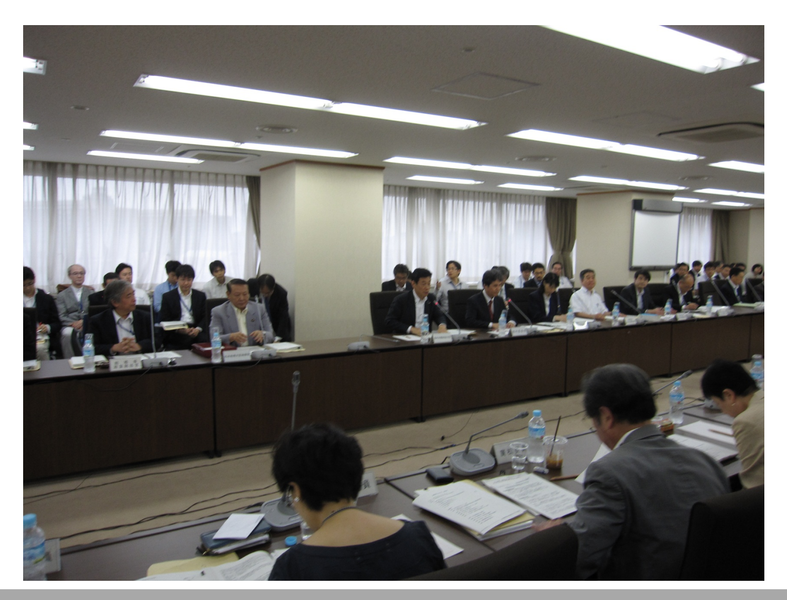
the Statistics Commission