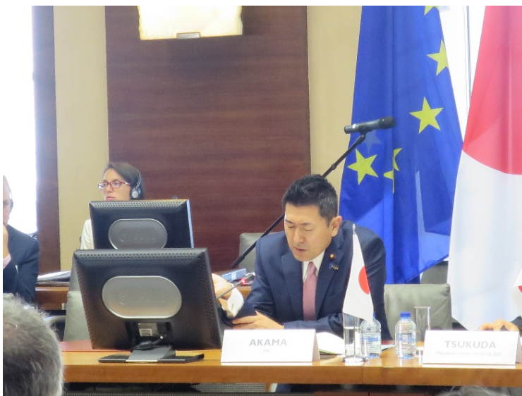
Photo: State Minister for MIC Jiro Akama made a presentation at the EU-Japan Business Round Table (BRT)

On Tuesday, July 13, State Minister for Internal Affairs and Communications Jiro Akama visited Italy, which holds the presidency of the G7, and held talks with Minister of Economic Development Carlo Calenda over the G7 ICT and Industry Minister's meeting, which will be held in Turin this September. Furthermore, the State Minister held talks with President Angelo Marcello Cardani of the Communications Regulatory Authority and exchanged views on the information and communications policies of both countries.