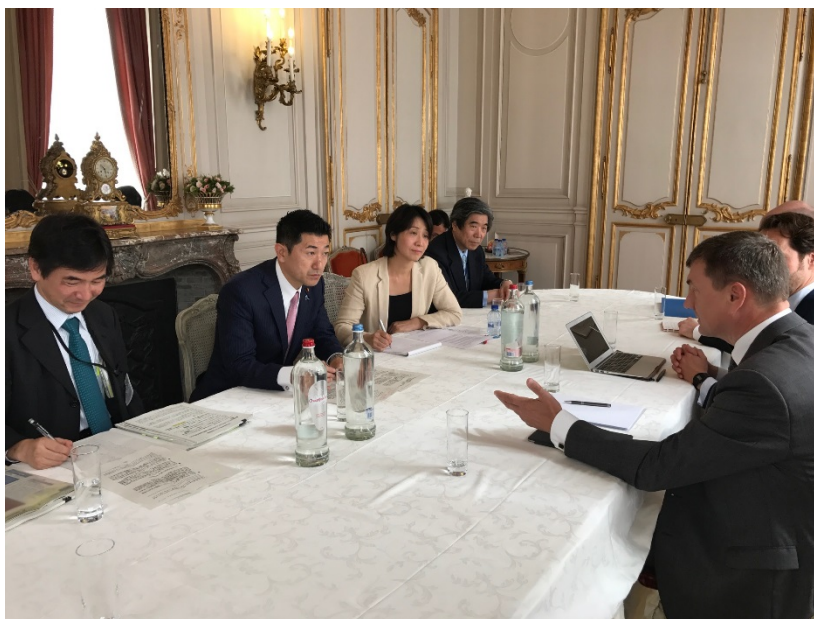
Photo: Talking with Mr. Andrus Ansip (EC Vice-President – Digital Single Market)